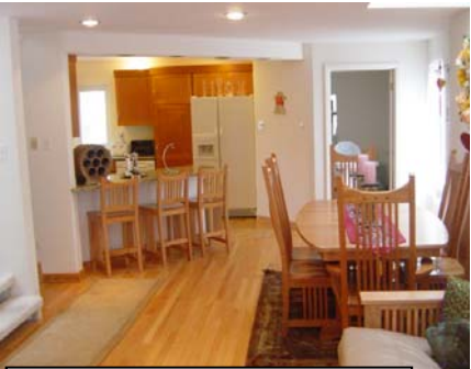
Dining Room and Kitchen