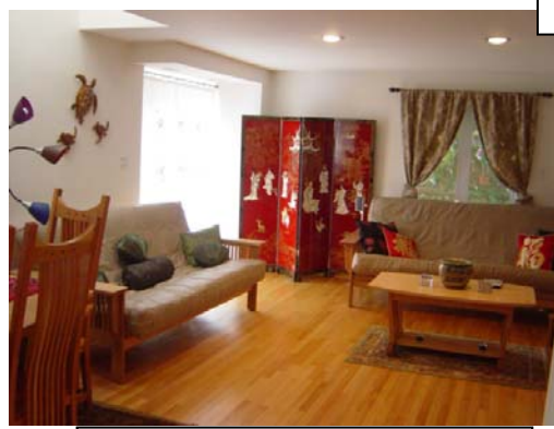
Dining Room and Living Room