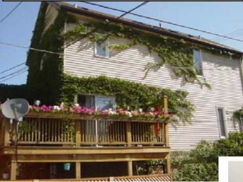
South Side showing the deck. South exposure plus sky lights make for a very bright home.

China Doll IV is a single residence with 1920 sq. ft. of living area plus a built in garage. Each of the two 3 rd floor bedrooms has a full private bath. Each of the other two floors has a half bath. The ground floor has laundry facilities and a third bedroom. There is also a complete office area on the 3 rd floor with a computer and a multi-function printer/fax. The main floor is one large open room with living room, dining room, and kitchen. There are 2 full beds in the large bedroom, two twins in the 2 nd bedroom, a full futon in the 3 rd bedroom, two queen futons in the living room, and available Aerobeds.