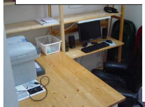
Complete office with Wireless DSL