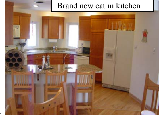
Brand new eat in kitchen