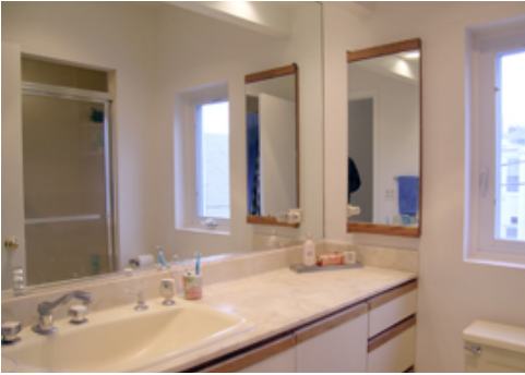
Private Bath for Largest Bedroom