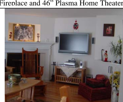
Fireplace and 46" Plasma Home Theater