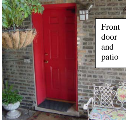
Front door and patio